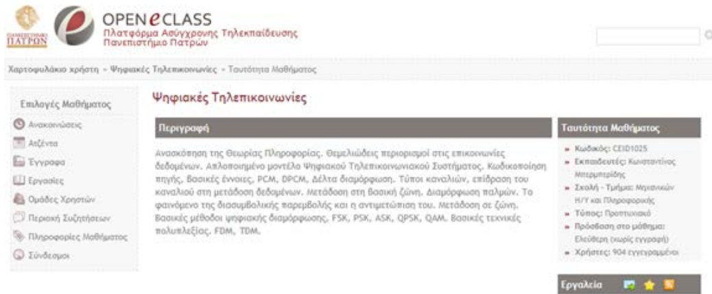
Figure 2. The eClass-based system for the course “Digital Telecommunications” (second study).

The provided questionnaire comprised SUS items as well as general demographics questions and questions related to the participants’ internet self-efficacy (ISE) and internet user attitude (IUA). Already validated constructs were used to measure ISE and IUA (Papastergiou, 2010). Furthermore, students were asked to state whether they had prior experience with the LMS system used in their course (yes/no), and also rate on a 1 (not at all frequently) to 5 (very frequently) scale the usage frequency of their course’s LMS. Moreover, an adjective rating was used to collect students’ ratings of the LMS perceived usability according to a 7-point adjective rating scale (Bangor et al., 2009).